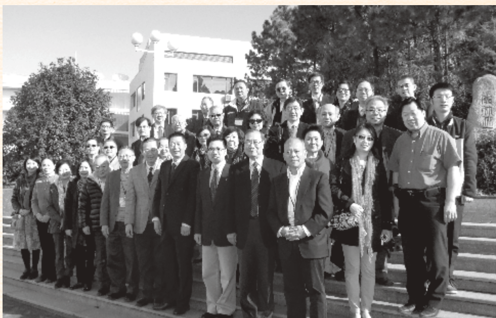
The delegation from North America and Hong Kong visited Nanjing Union Theological Seminary.

In the past two decades, by God’s grace and through the connections of our Chinese Culture Research Center, CGST has started academic exchanges with Christian scholars and researchers in Mainland universities. We have also made some contributions in the training of teachers from seminaries in Mainland China. Beginning summer of 2004, CGST has welcomed pastors and leaders of Mainland churches to enroll in our Putonghua Intensive Theological Training Programs. They are able to further their studies in the areas of biblical studies, theological studies, pastoral ministry, and missiological studies. Their participation in spiritual formation groups and retreats also enable them to be nurtured and grow. Looking back, we are amazed that the over 200 students and alumni from Mainland China have come from provinces spread across most parts of China. This indeed is the gracious guidance of our Lord. We are unworthy servants, we have only done what was our duty.