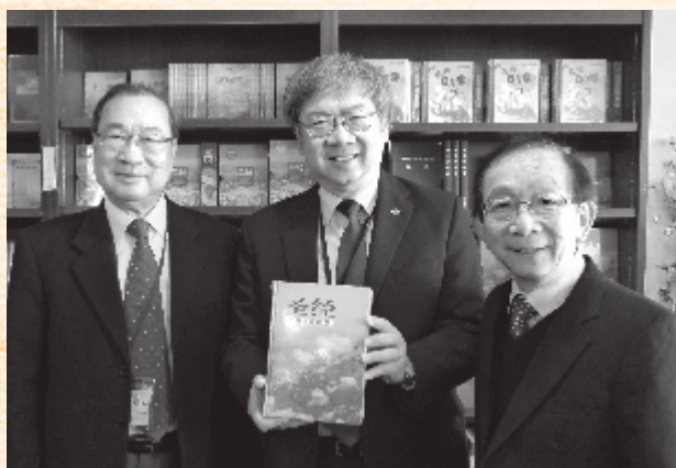
Three CGST Presidents visited Shanghai together. The Bible-CGST Study Edition is available for purchase at a local church book store.