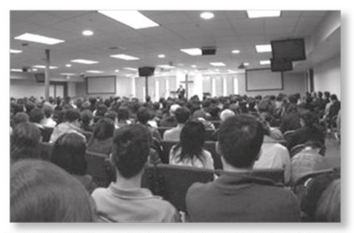
350 brothers and sisters of the Bay Area at a Friday CGST Revival Seminar held in San Jose